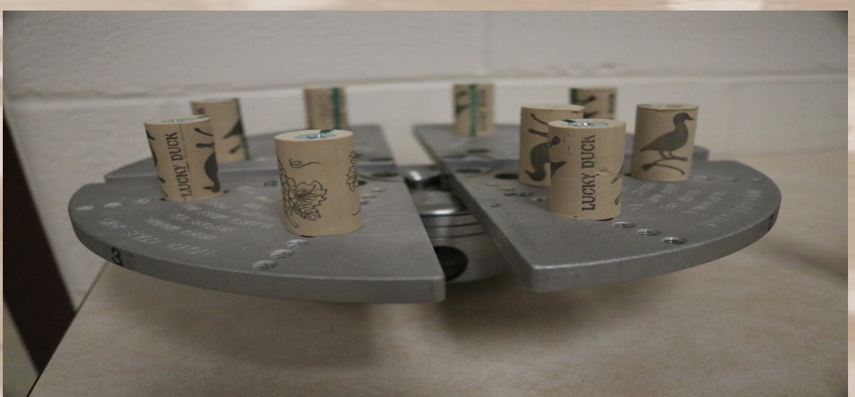
Plastic Wine Corks