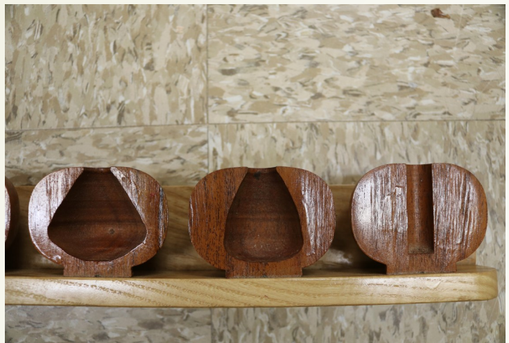
Board to show hollowing steps for an ornament