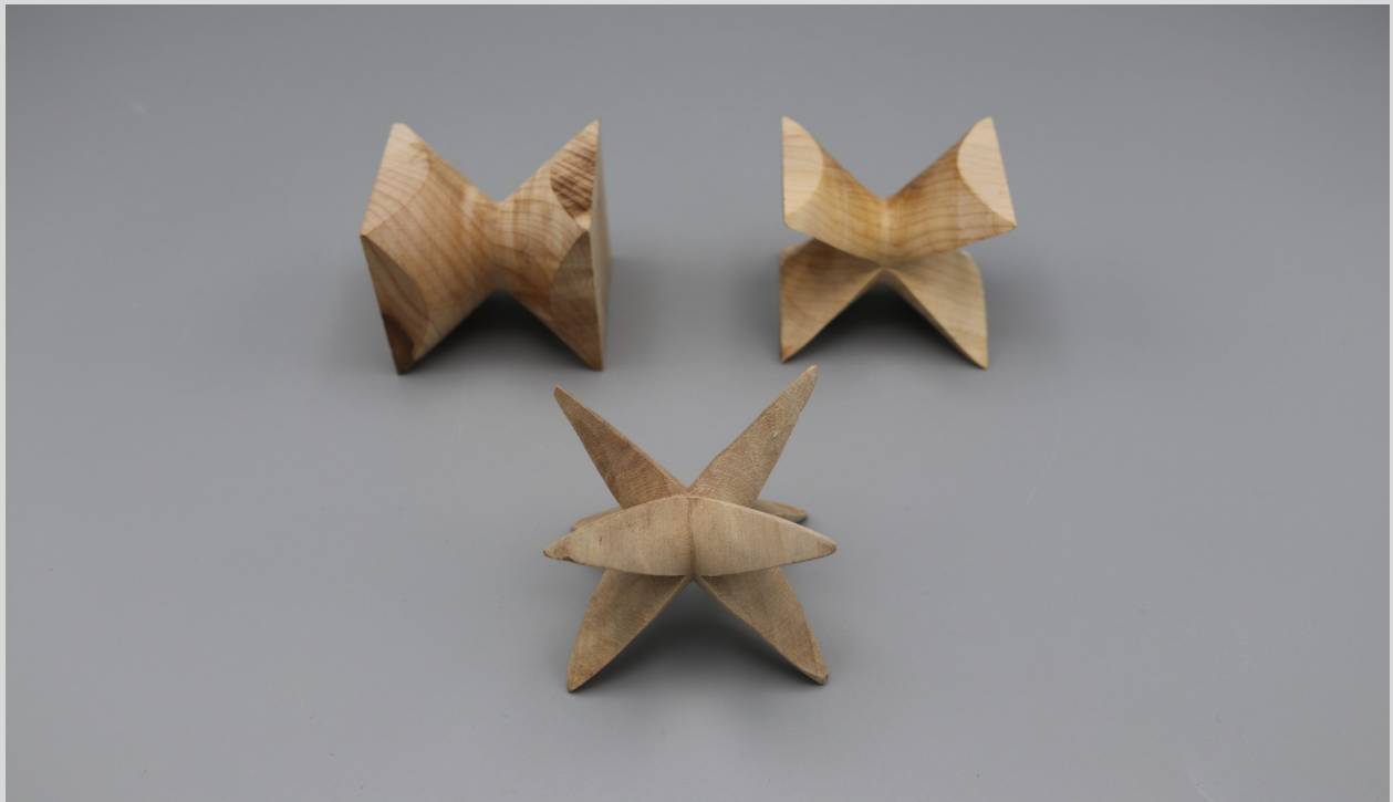
Three Axis Views

Directions are on our website: Baylakewoodturners.com