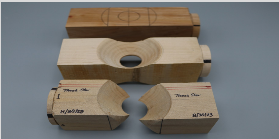
Making the Jig