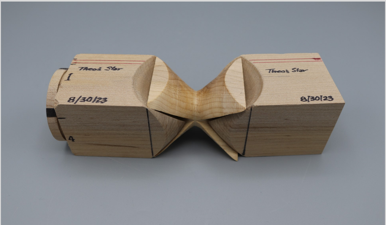
First Axis in Jig