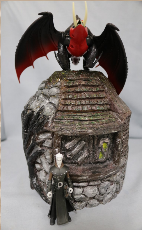
Beads of Courage Boxes